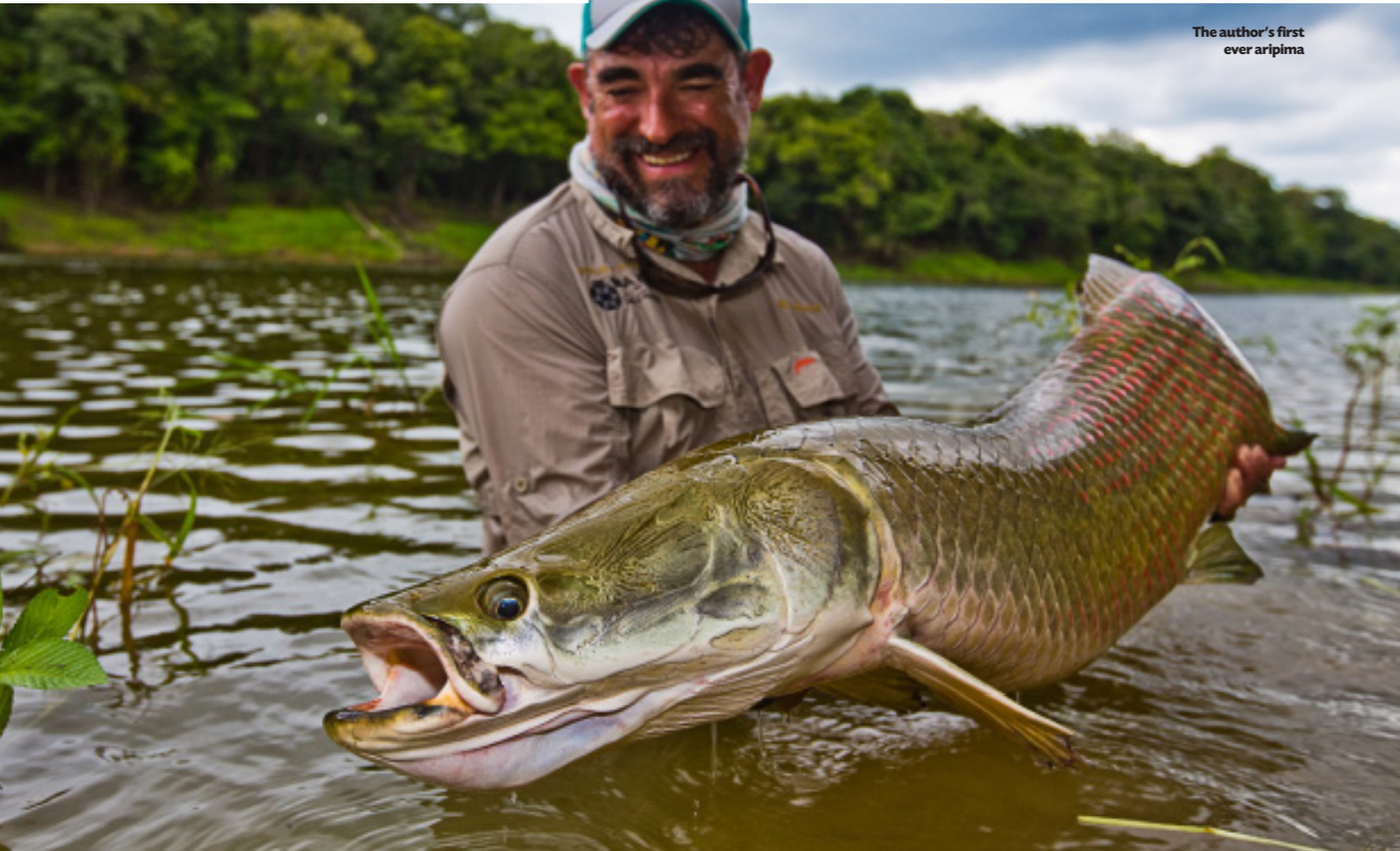
The author's first ever arapaima

round not by the prow, but by the vast weight of the stern and the engine. The line scorched through my fingers, and I felt the monstrous power of the huge creature as it shook its head with a truly astonishing ferocity.